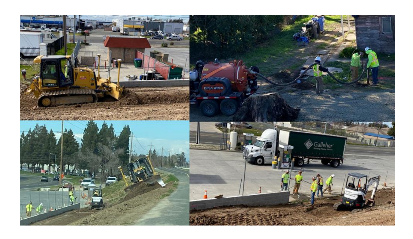
Reach H: Levee improvements and Seepage Berm construction