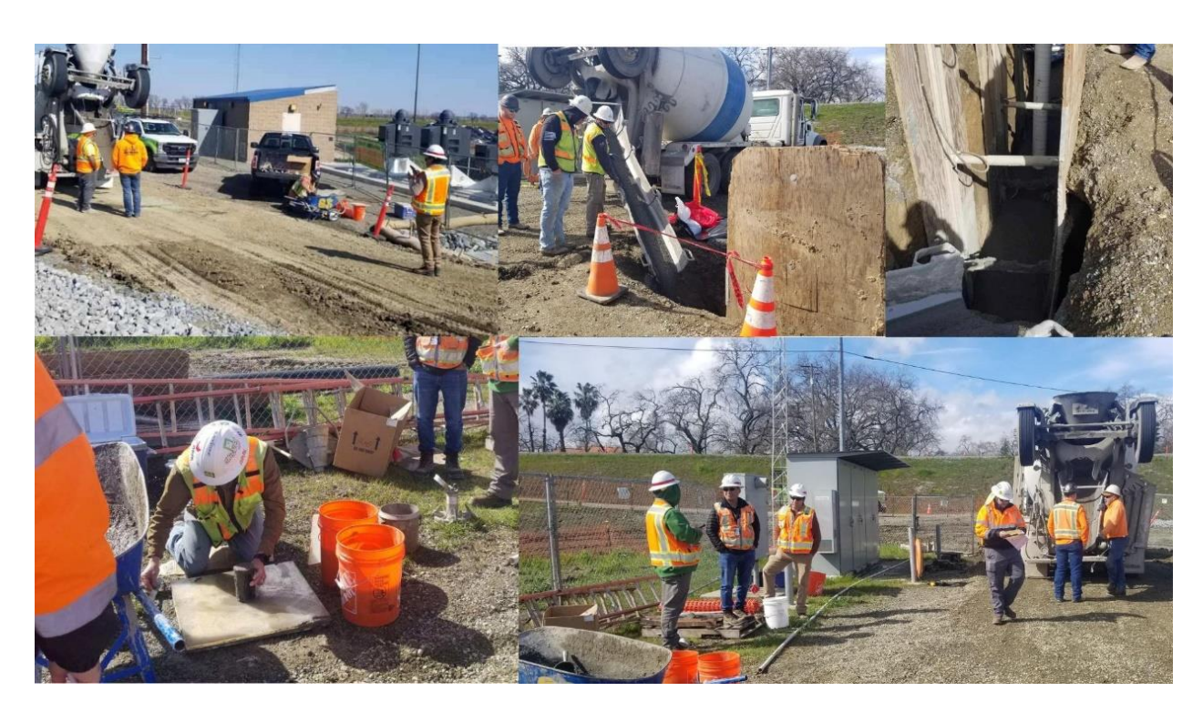
Reach B: Pumping Plant No. 3 Relief Well Controlled Low Strength Material backfill